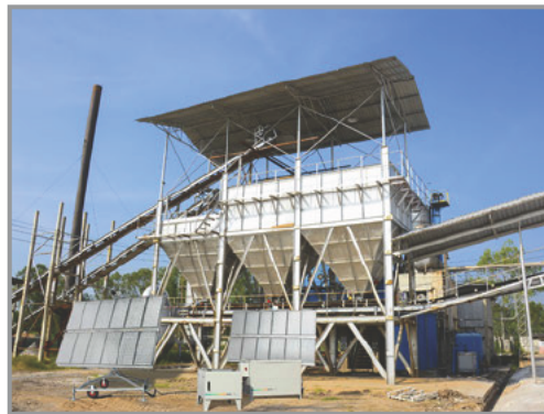
Machines, Workshop, ...